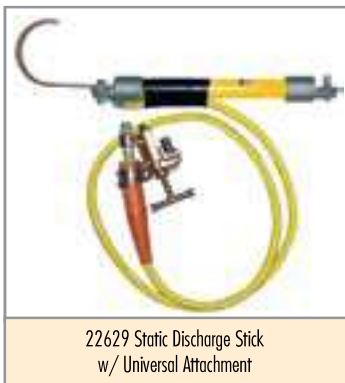
22629 Static Discharge Stick w/ Universal Attachment