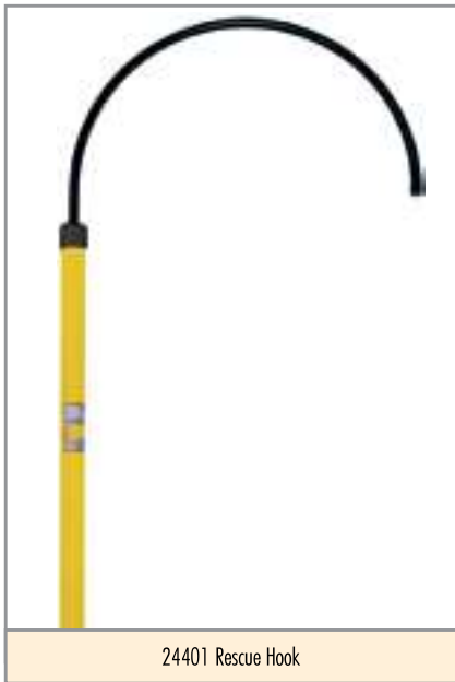
24401 Rescue Hook