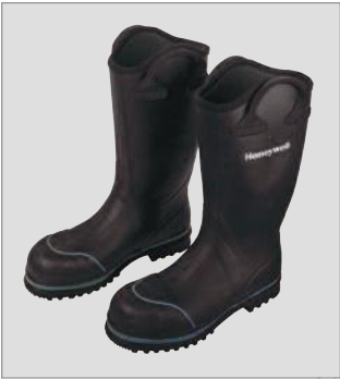
Model 1000 Ranger™ Air

Premium, top of the line model, offers complete protection and lightweight comfort. Only rubber boot on the market utilizing athletic spacer mesh material laminated to buoyant, waterproof neoprene. A combination of natural rubber and butyl rubber ensures complete chemical protection to certified standards.