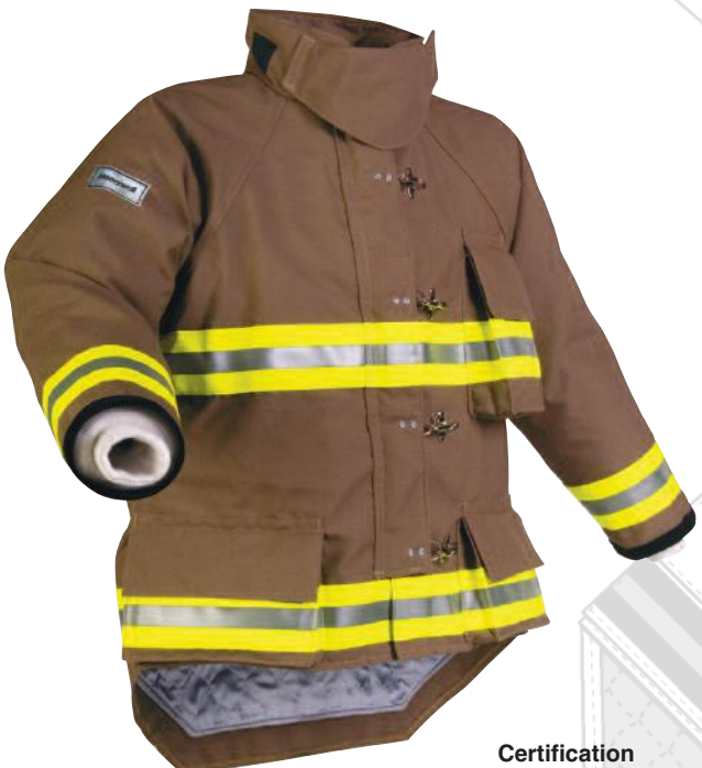
Certification NFPA 1971