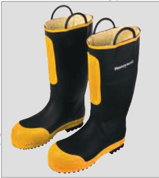
Models 1500 & 2500

Certification • NFPA 1971 • NFPA 1992 • Protocol TOP-8-2-501*